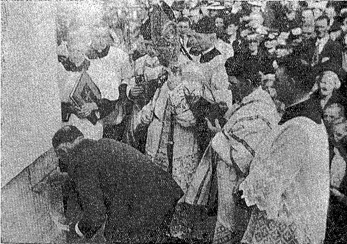
Archbishop Beckmann and other church dignitaries present as historical stone is being sealed in place

Archbishop Beckmann of Dubuque Officiated at Ceremony.